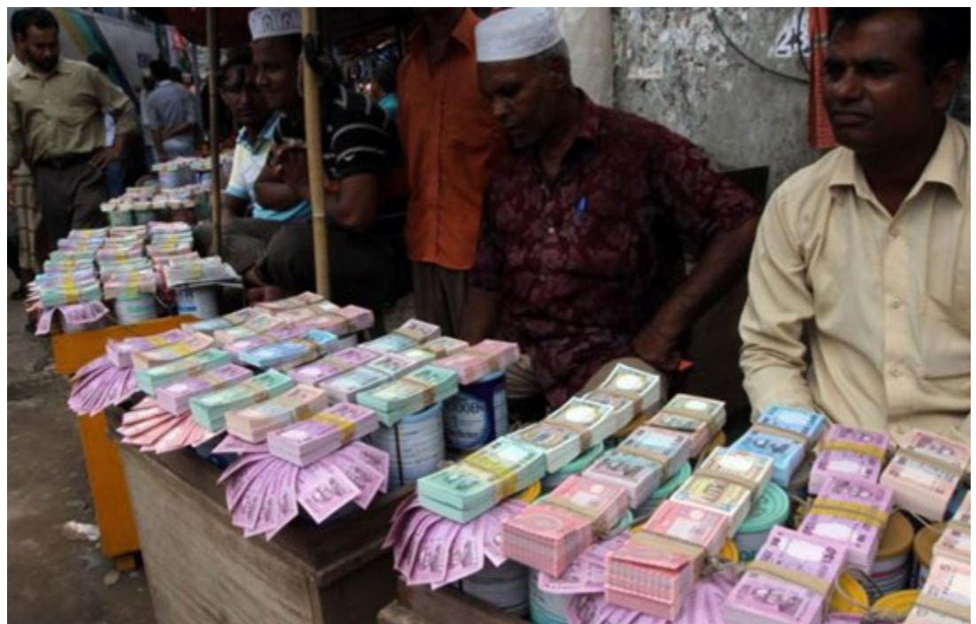
“Vendors are seen selling taka notes, a common scene on the streets of Motijheel in Dhaka thanks to the popularity of cash in Bangladesh.”

As a result, in the coming years, the Asia-Pacific middle class will likely increasingly dominate in terms of their priorities, needs, and tastes as they make their economic and social imprints and companies try to win their money. All eyes will turn toward Asia-Pacific. Increasing digital inclusion, digital payments, and financial sophistication now will help foster and meet that eventuality.